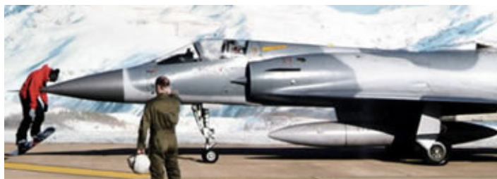
An unfortunate outcome to a NATO Low-Altitude-Recon Drill

Veterans seeking to use the Veterans Choice Program or wanting to know more about it, can call 1-866-606-8198 to confirm their eligibility and to schedule an appointment. For more details about the Veterans Choice Program and VA's progress, visit: www.va.gov/opa/choiceact .