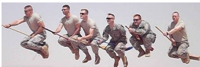
Budget cuts move the Air Force to economize with new training methods.

On January 31 st , a large group of members, spouses and friends saw the comedy "The Addams Family". Based on the past, we laughed and had a good time. Either late spring and/or fall we will plan another outing(s), so keep Sunday evenings open and join us.